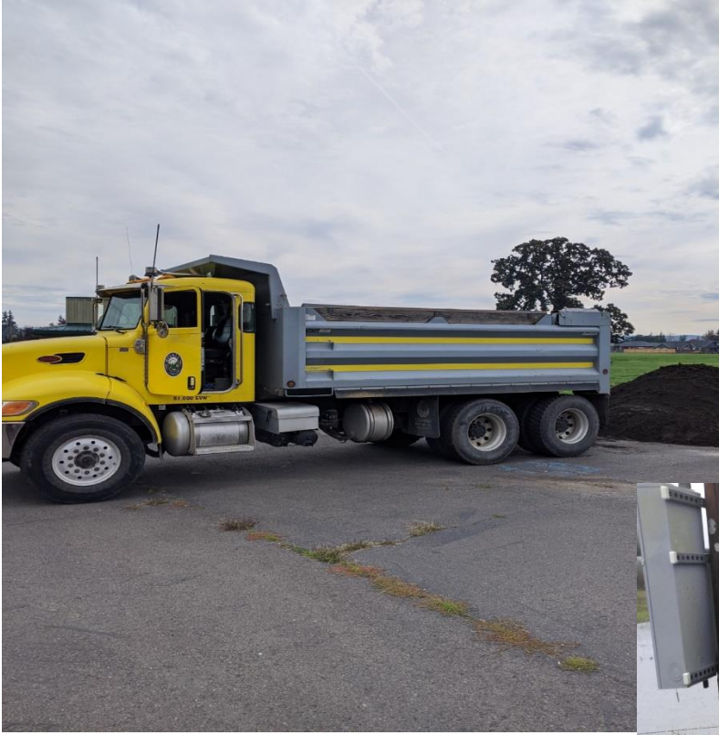
The City of Molalla provided sand and sandbags at Bohlander Field for the community during localized flooding. Public works crews continually cleared catch basins and provided support where needed.