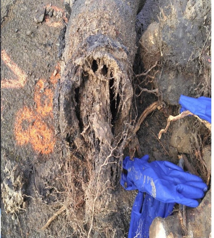
Public Works Crews replacing a failed sewer lateral that was filled with tree roots.